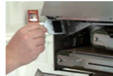
Rinse fan filters.