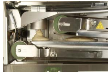
Mix dispenses automatically.