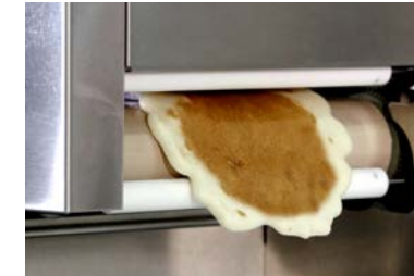
Pancakes in under a minute.