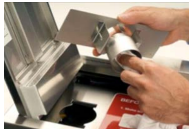
Wipe or dishwash.